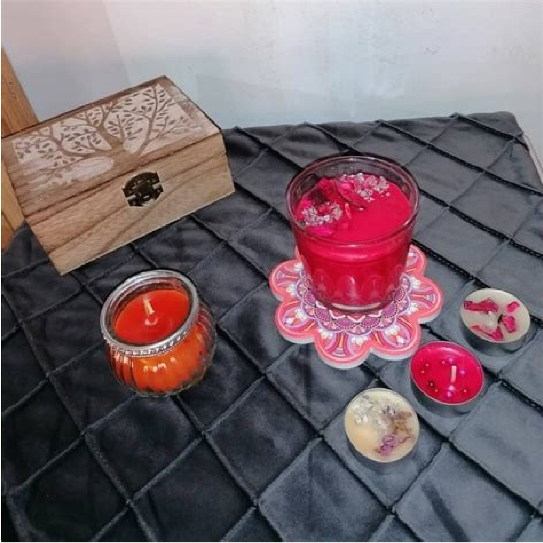
Material Color Palette