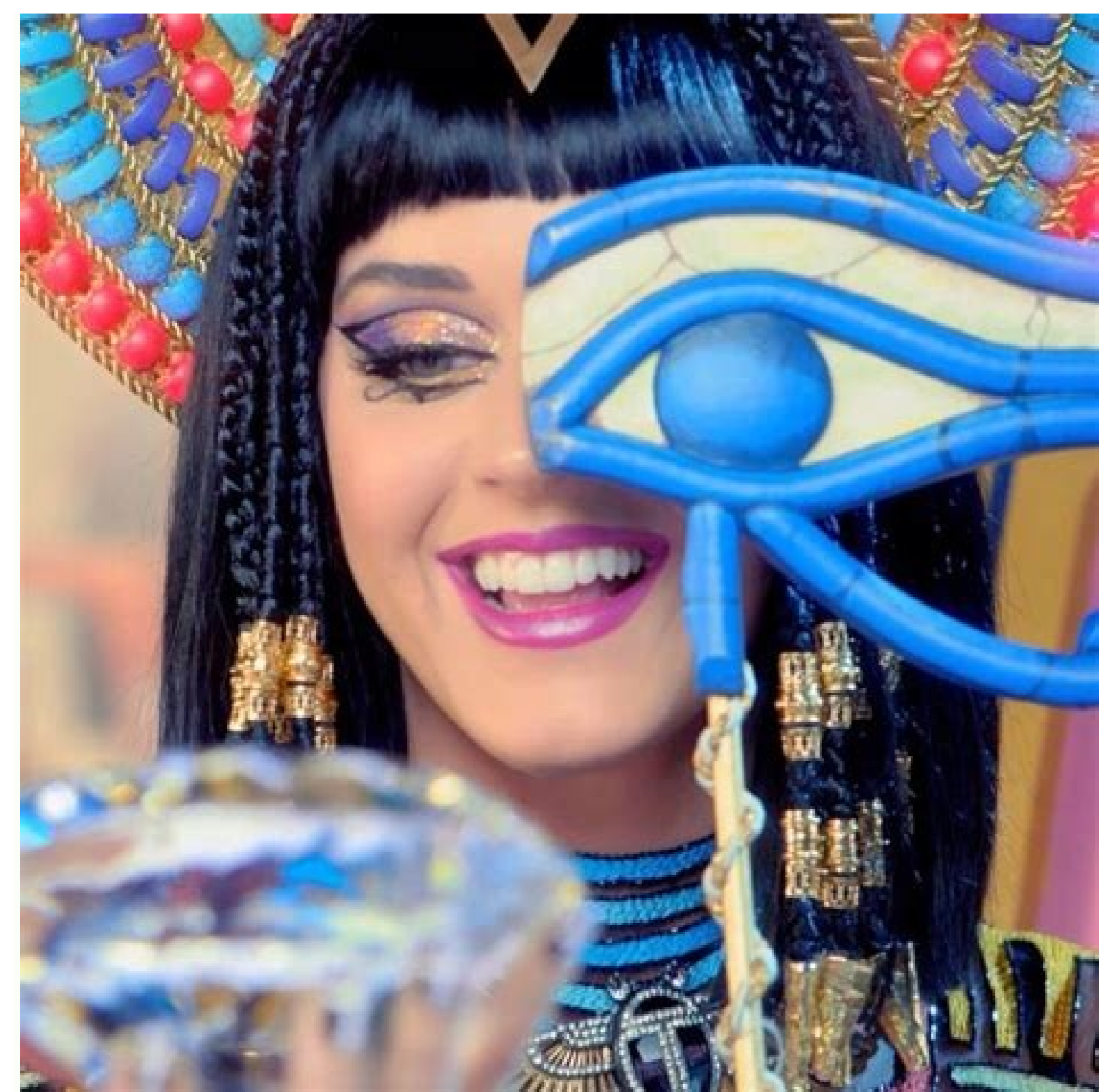
Katy perry small talk official video. Lyrics katy perry - small talk (official video). Katy perry small talk lyric video.