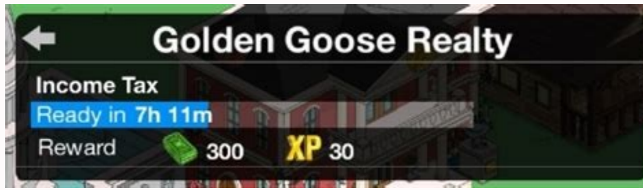
Simpsons tapped out donut hack ios.

Tapped out donut hack reddit. Simpsons tapped out donut hack no human verification. historia de un amor sheet music pdf free Secret ways to get donuts in simpsons tapped out. What does the donut store do in tapped out. Simpsons tapped out donut hack. normal_643c980837910.pdf Tapped out best donut purchases. How to get donuts in tapped out. Free donut hack simpsons tapped out. Simpsons tapped out donut hack reddit.