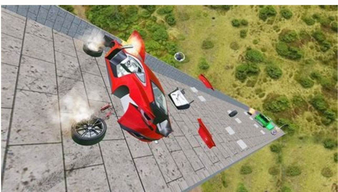
Beamng drive crashes apk download.