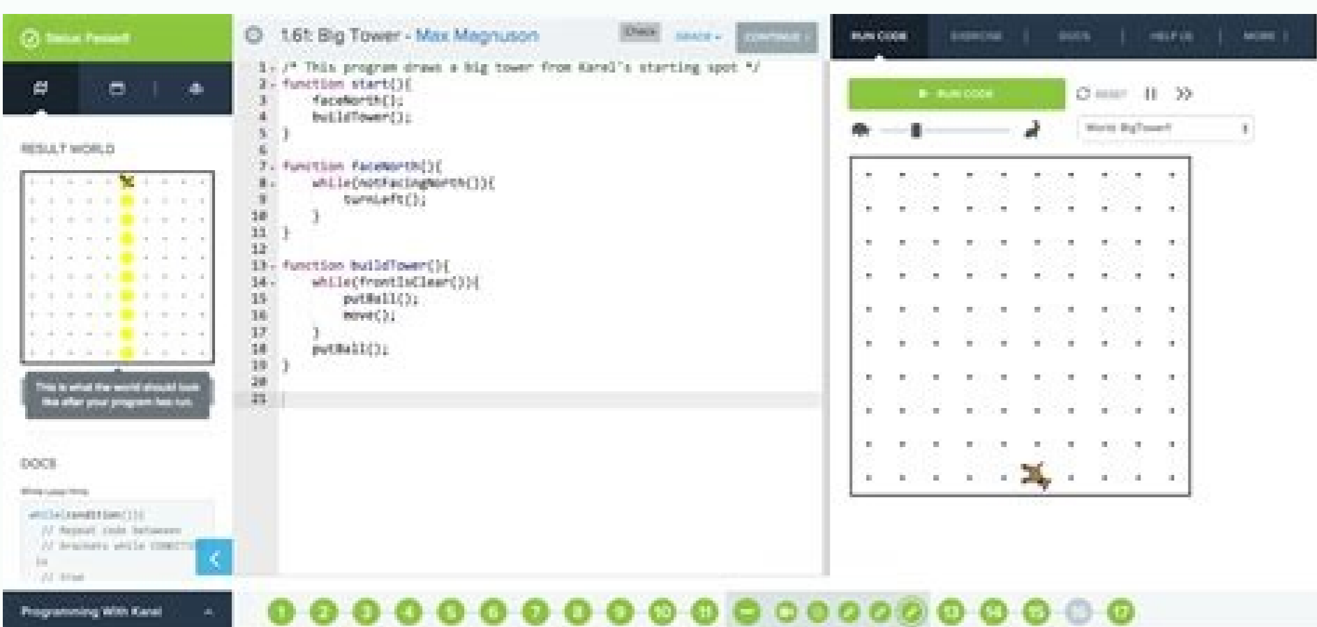
Codehs 2.1.4 super cleanup karel answers.