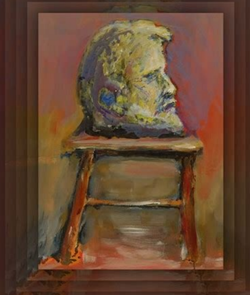
Poems by Bruce Bagnell